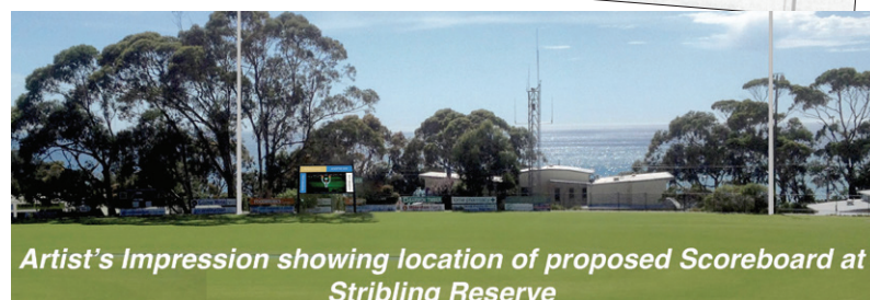
Artist's Impression showing location of proposed Scoreboard at Stribling Reserve

of these projects and if they are successful in the review process, we will inform of how to vote for these